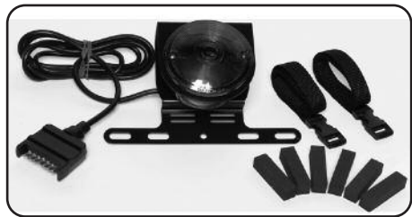
7 Pin Flat Plug Number Plate Light, Brake Light and Number Plate Mount. Part Number PRLF

Check all joints, screws, straps and fittings regularly and prior to each use. Any worn or damaged straps or hooks should be replaced immediately. Check all screws and nuts. Check all relevant road laws in your state regarding the use of bicycle racks on vehicles. The number plate may be obscured and therefore a special bike rack number plate may be required. This new number plate may also need to be lit if the bike rack is being used at night. Refer to the pictures below for accessories available separately from most bicycle retailers.