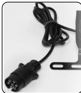
Also available with 7 Pin Round Plug Part Number PRLR